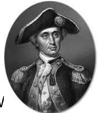
Capt. John Paul Jones